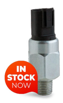
SKDF Integrated Deutsch receptacle