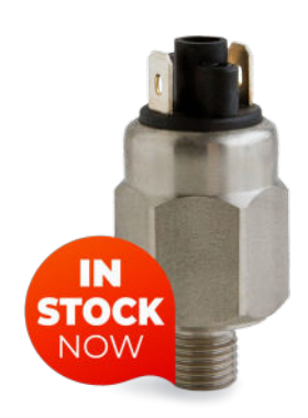
SKBA High-pressure miniature switch

For product selection and technical information, Contact Flow Products to speak with one of our engineers so that we may work with you to select the right pressure switch for your application.