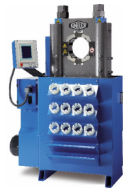
UniFlex HM325 Semi- Automated Hose Crimper