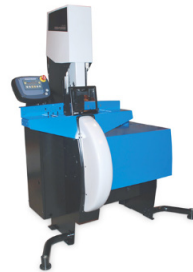
Finn-Power CM91 Semi-Automated Hose Cutter

We have dedicated work cells complete with state of the art automated and semi-automated equipment with in-process inspection procedures. This assures high quality custom hoses, adherence to application requirements and timely deliveries, all designed to meet our customer's needs.