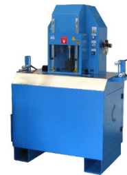
UniFlex -EM-115.4 Semi Automated Hose Cutter