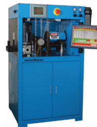
Markem 500-S Automated Hose Cutter