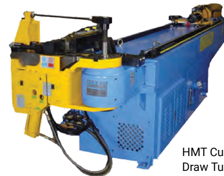
HMT Custom Rotary Draw Tube Bending Machine